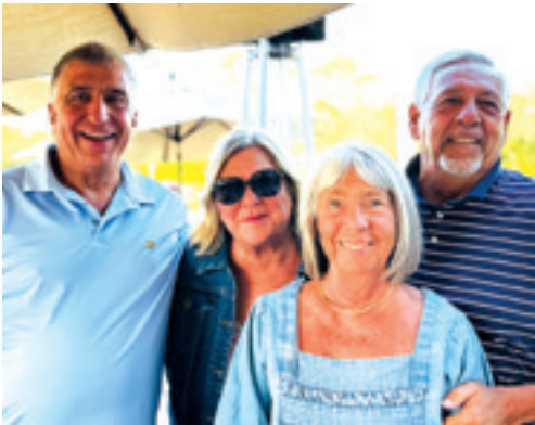
Welcome Back Party