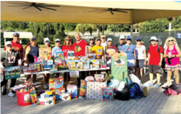
More than 100 toys were donated for Guadalupe Center at the Fan Friday Tennis Round Robin and Pickleball Open.