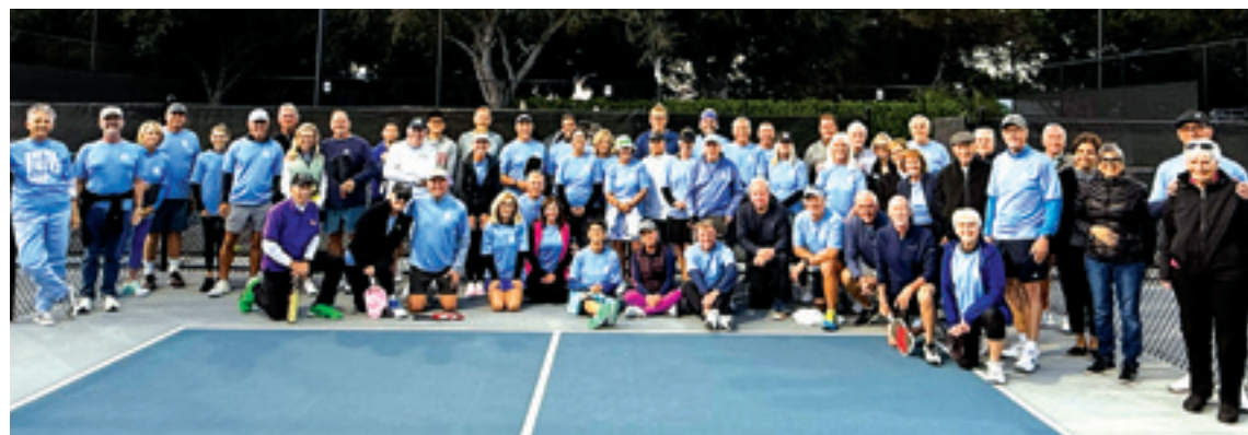
Tarantino Pickleball Open

Open, where we donated food and raised more than $3,000 for Help's Outreach. Additionally, we hosted the Naples Pro Tennis League. With the help of many volunteers, this event was a resounding success.