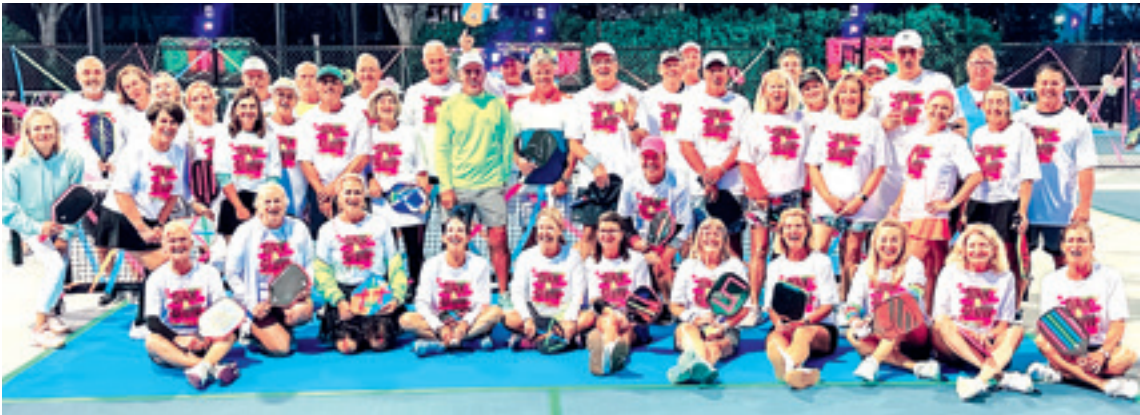
2025 Dink and Glow group